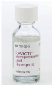
Bottle of RAVICTI