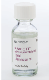
Bottle of RAVICTI