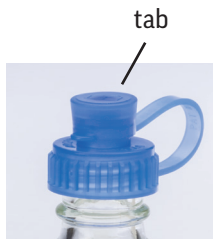
Reclosable bottle cap adapter